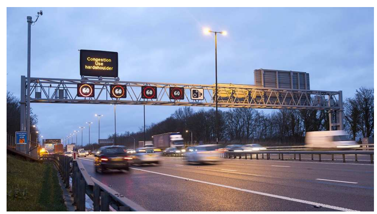
M4 Smart Motorway