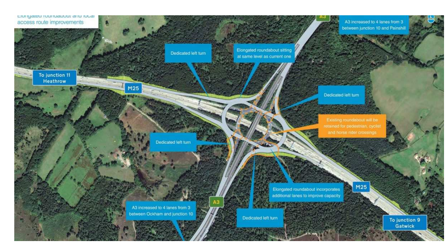
M25 Wisley Interchange